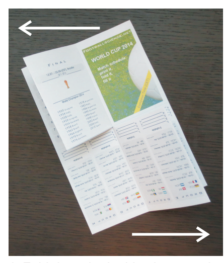
4. Fold down both sides in oppostie directions.