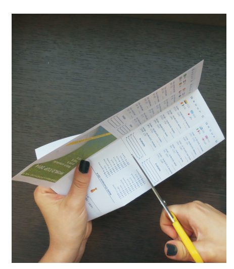
3. Cut along thick line in the middle.