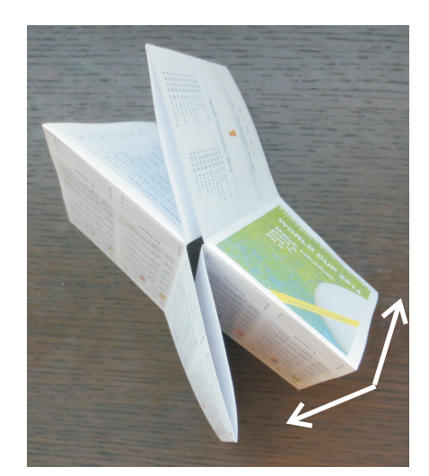
6. Now fold in the middle.