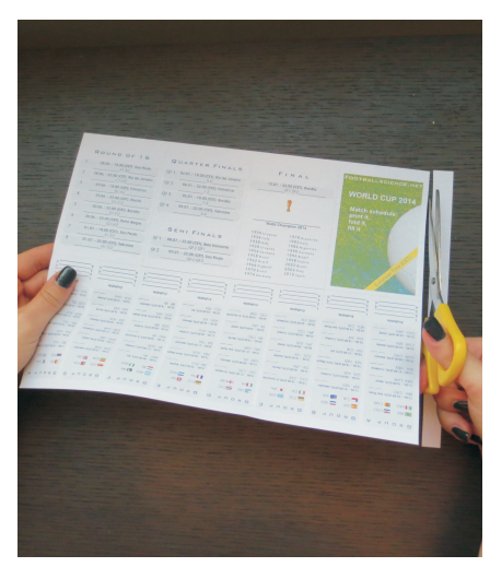
1. Print out Match schedule.pdf and place with the top cover on the left.

Please note: Use printer setting ,Fit to paper' and cut edge of the paper (see Photo 1)