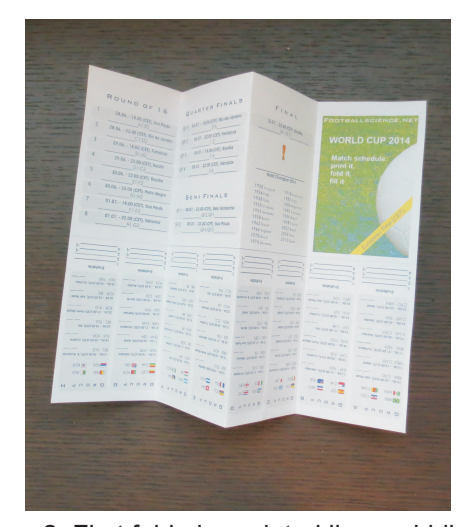
2. First fold along doted lines middle and afterwards quarter lines.