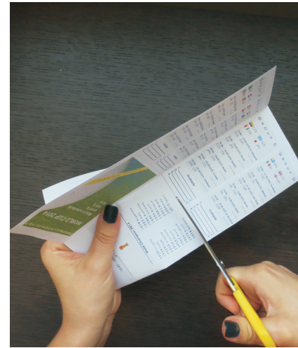
3. Cut along thick line in the middle.