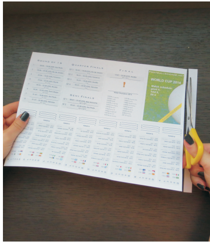
1. Print out Match schedule.pdf and place with the top cover on the left.

Please note: Use printer setting 'Fit to paper' and cut edge of the paper (see Photo 1)