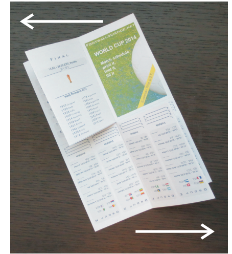
4. Fold down both sides in opposite directions.