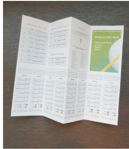
2. First fold along dotted lines middle and afterwards quarter lines.