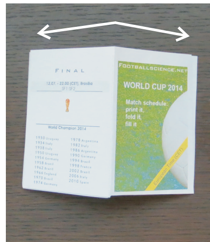
7. Fold the middle again.